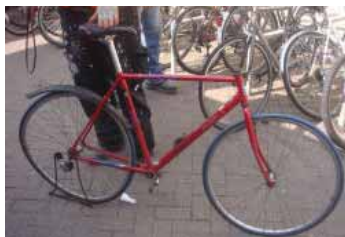
BTP officers check for abandoned and neglected bikes

Cyclists now have more room to secure their bikes at East Putney Tube station after British Transport Police (BTP) officers removed disused and vandalised cycles from the bike racks.